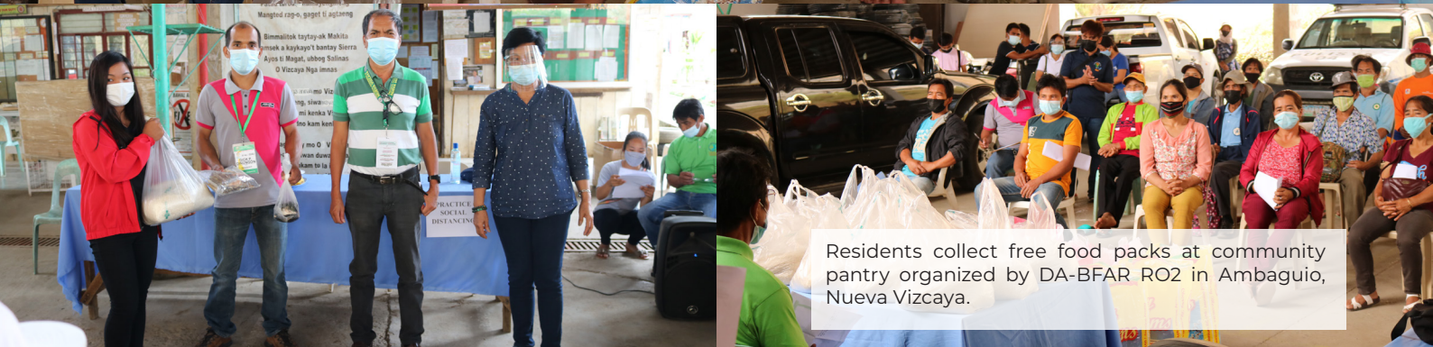
Residents collect free food packs at community pantry organized by DA-BFAR RO2 in Ambaguio, Nueva Vizcaya.