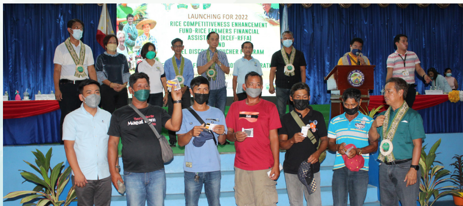
Isabela Fisherfolk waved their "Card" as proof of being one of the beneficiaries of the Fuel Discount Voucher Program of the Department of Agriculture. DA Secretary William Dar led the distribution during his visit in Ilagan City on May 20, 2022 as part of the Farmers and Fisherfolk Month Celebration.

Representatives from the ONE DA family witnessed the initial distribution of cards in Cagayan and Isabela.