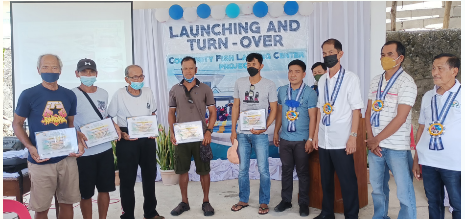
Ivatan fisherfolk received fisheries projects as mitigating measure against the effects of COVID-19 pandemic. Twelve units of motorized fiber glass boat with complete accessories, 30 units of non-motorized “Tataya”, and 6 sets of fish trading paraphernalia were awarded by DA-BFAR 2.

“The distribution of livelihood inputs was aimed at supporting the food security and sustainable income for the fisherfolk. This will not just