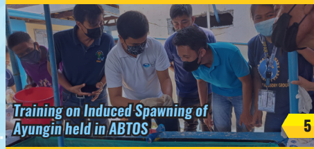
Training on Induced Spawning of Ayungin held in ABTOS