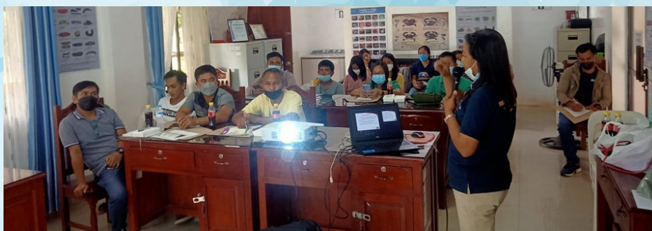
Fisheries Technicians from Diffun and Maddela were trained on Tilapia Hatchery Management as a move to boost fisheries production in the landlocked province of Quirino.

The Bureau of Fisheries and Aquatic Resources has conducted series of training on aquaculture in Aglipay and Diffun, Quirino to boost fisheries production and achieve fish sufficiency in the landlocked province.