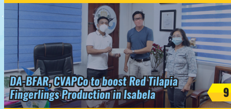
DA-BFAR, CVAPCo to boost Red Tilapia Fingerlings Production in Isabela