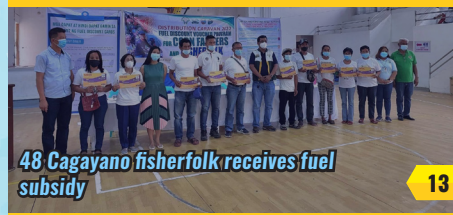
48 Cagayano fisherfolk receives fuel subsidy