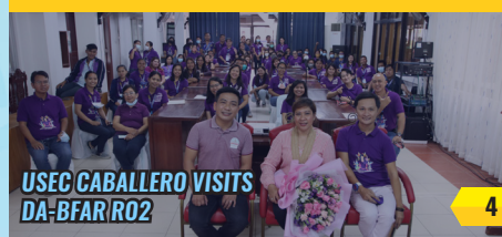
USEC CABALLERO VISITS DA-BFAR R02